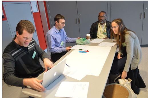
Figure 2: Participating in hands-on teaching activities. BC Association of Physics Teachers and Telus World of Science hosted a very successful physics Pro-D event on Friday, February 19, 2016. The event was very well attended even though it was NOT a provincial Pro-D day! We were very impressed with many teachers who had to do special arrangement with their schools to attend the event (we are grateful for their participation).

Courtyard. We are grateful to SFU Department of Physics for sponsoring us. We also voted to elect new Executive Committee members and changed the constitution to create a BCAPT Advisory Board.