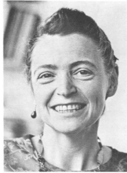
Highly regarded as a classroom

Dr. Dresselhaus, a Boston SWE Section Senior Member, is professor of electrical engineering and Abby Rockefeller Mauze Professor at Massachusetts Institute of Tech-